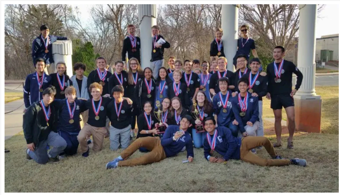
— The Casady Division B and Division C teams.

Casady Schools successfully defended their 2015 championship by taking first place in both divisions of the team competitions of the 2016 Oklahoma Science Olympiad State Tournament held on the campus of the University of Central Oklahoma in Edmond this past Saturday. 30 teams competed in 46 events during a full day of spirited competition on a beautiful spring day.