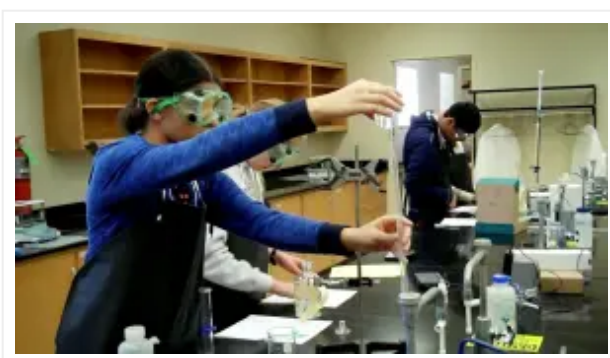
— Chem Lab

Finally, to the Olympians and their Coaches, Congratulations on a great Tournament Season. The Oklahoma Science Olympiad experienced tremendous growth this year and together, next year will be even better. The valuable feedback from this year's tournament participants is already bearing fruit as plans are already underway for teacher workshops this summer and next fall and the start of the 2013-14 Tournament season in November!