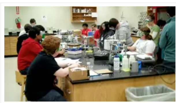
— Keep the Heat

And of course, much thanks goes to the small army of Event Supervisors who developed, set-up, ran, and judged the 40 events that were a part of this year's State Finals.